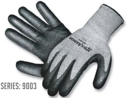
LEVEL SIX SERIES: 9003