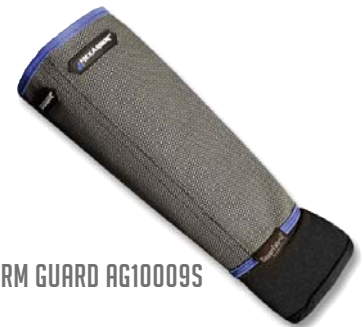
9" ARM GUARD AG10009S